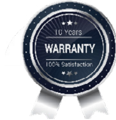
Our Industry-Leading 10-Year Limited Warranty Guarantees Unsurpassed Quality