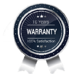
Our Industry-Leading 10-Year Limited Warranty Guarantees Unsurpassed Quality