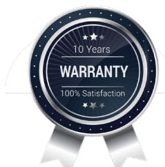
Our Industry-Leading 10-Year Limited Warranty Guarantees Unsurpassed Quality