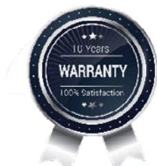
Our Industry-Leading 10-Year Limited Warranty Guarantees Unsurpassed Quality