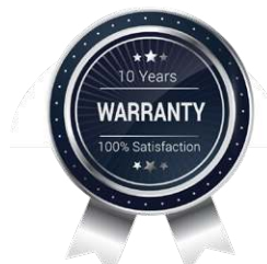
Our Industry-Leading 10-Year Limited Warranty Guarantees Unsurpassed Quality