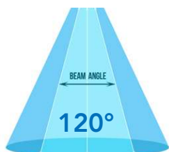
Patriot LED Light Distribution