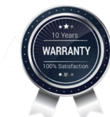
Our Industry-Leading 10-Year Limited Warranty Guarantees Unsurpassed Quality