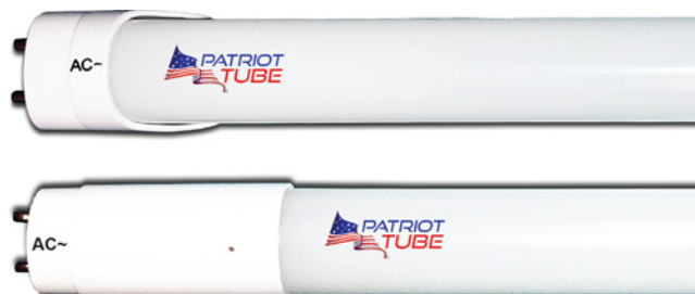
*NANO All Plastic Lens