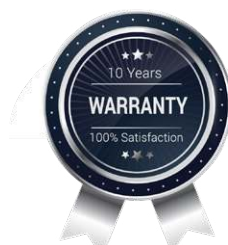
Our Industry-Leading 10-Year Limited Warranty Guarantees Unsurpassed Quality